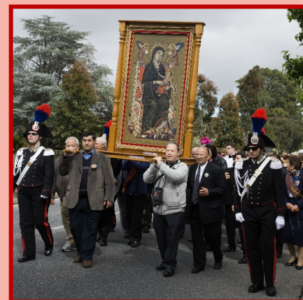
CELEBRATING OUR MULTICULTURE