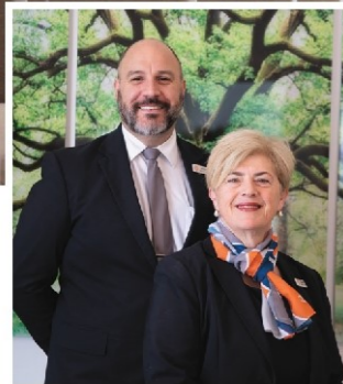
New Chapel at Blackwell Funerals Payneham